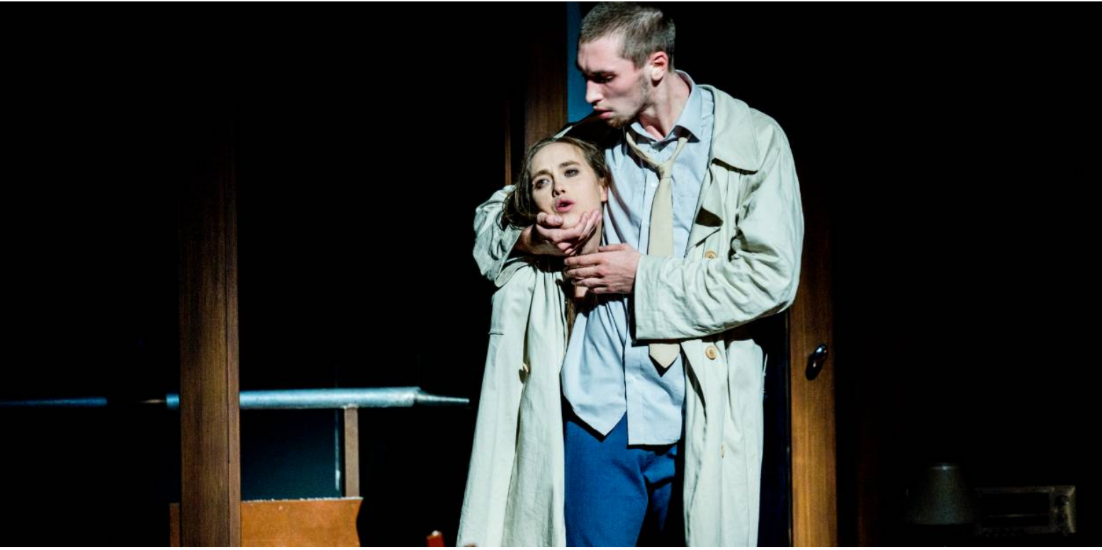
TRIPTYCH © Maarten Vanden Abeele, Peeping Tom