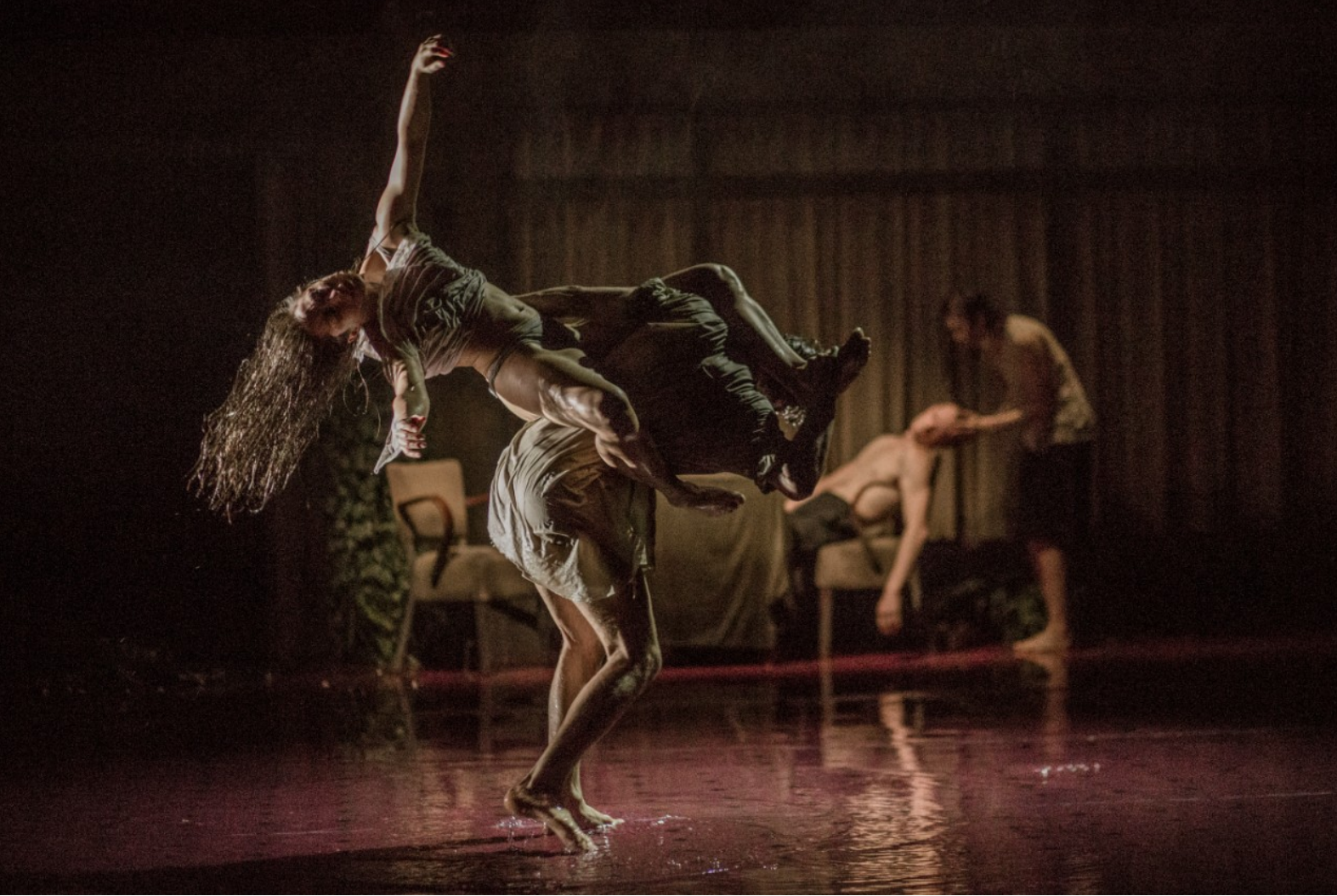
TRIPTYCH © Virginia Rota, Peeping Tom