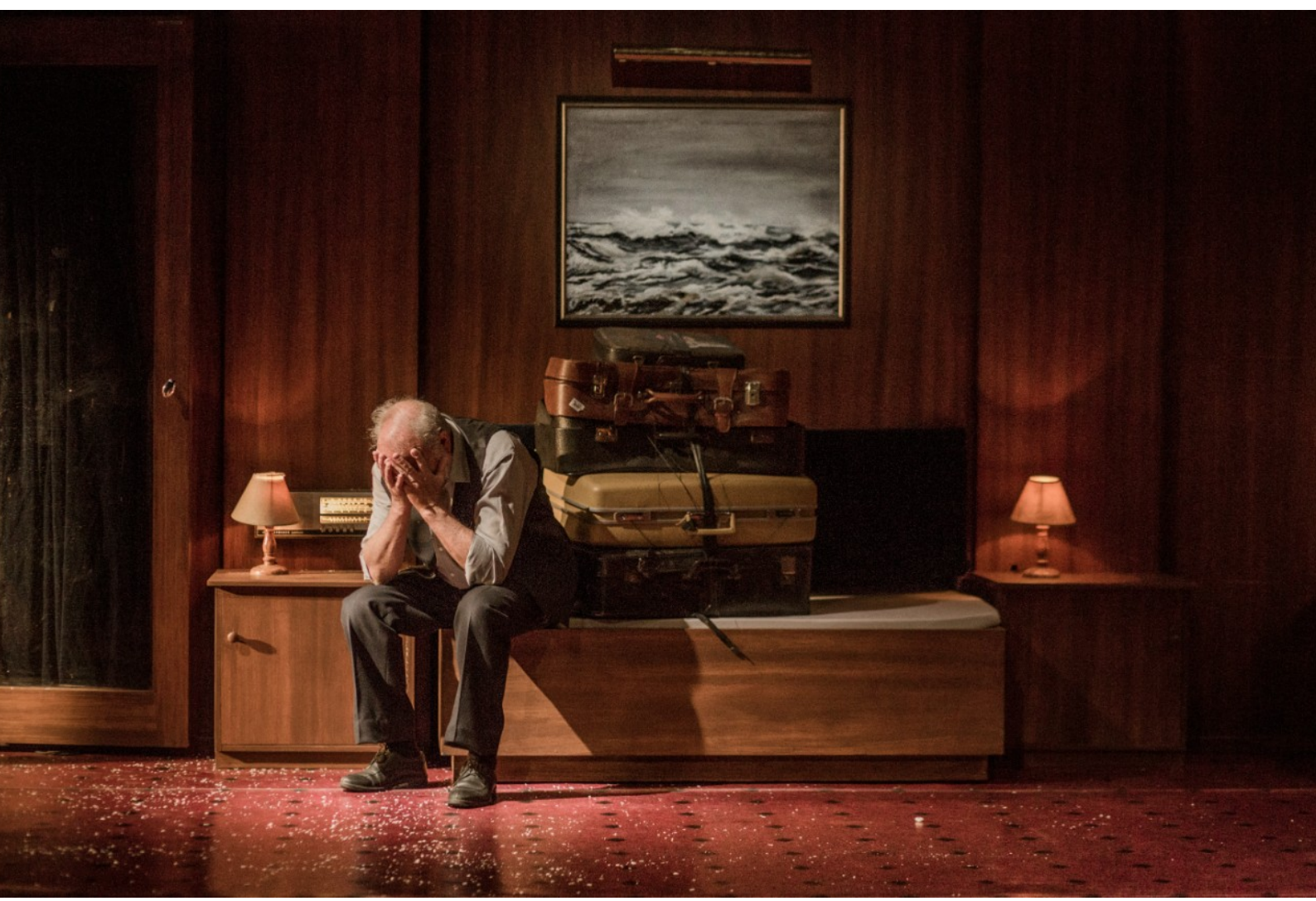
TRIPTYCH Peeping Tom